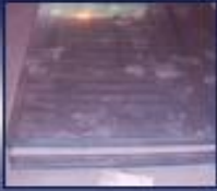
STEEL PLATES AND SHEETS