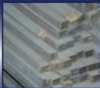
SOLID STEEL SQUARES