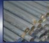
SOLID STEEL ROUND