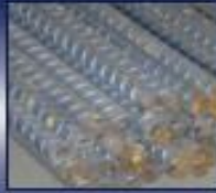
REBAR AND WIRE MESH